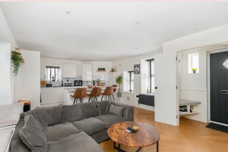
GROUND FLOOR 344 sq.ft. (32.0 sq.m.) approx.

APPROXIMATE FLOOR AREA 67 SQM / 721 SQFT